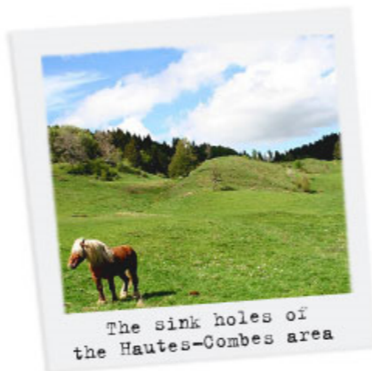
The sink holes of the Hautes-Combes area

You'd be forgiven for forgetting that the Jura is packed with wild limestone formations and other strange geological features! However, just take a look at the Flumen Gorges (a pronounced gash in the rocks which stretches out for more than 4 km between Lajoux and Saint-Claude), the Lapiaz de Loulle (a huge slab of veined and eroded limestone near Champagnole), or the sink holes of the Hautes-Combes area (huge enclosed "funnels" characteristic of the karst erosion system). Kill three birds with one stone!