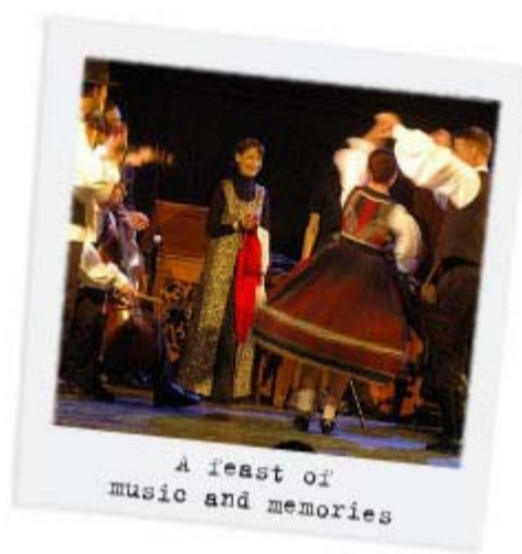
A feast of music and memories